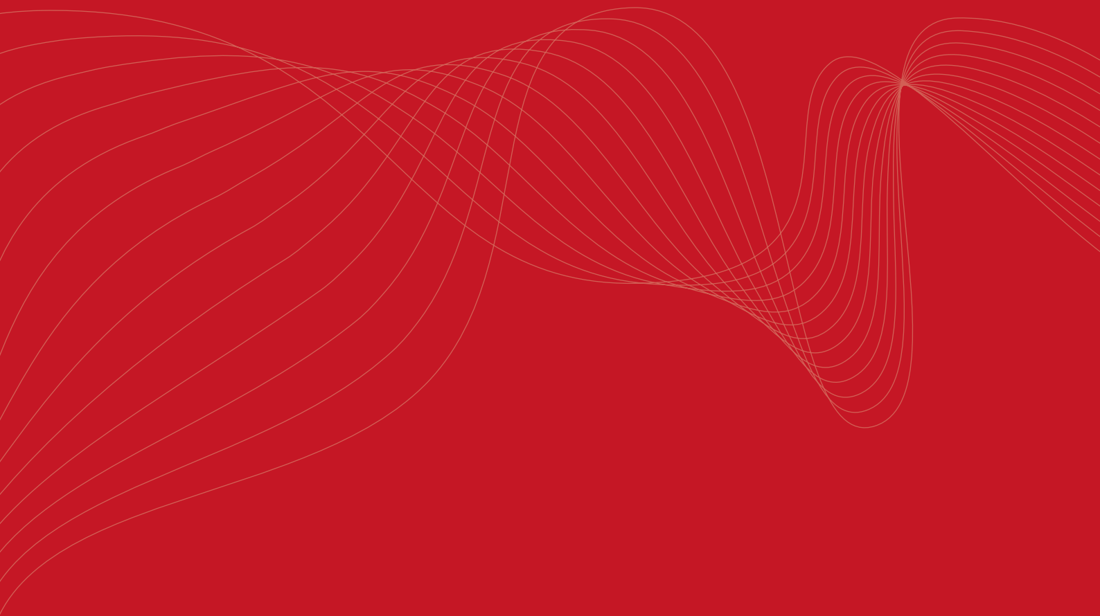
Table Section 2016